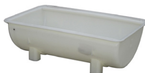
Wash trough 100 litre plastic