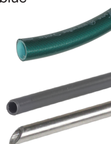
Pipe for detergent PVC or S/S

Fabdec Ltd , Grange Road, Ellesmere, Shropshire, SY12 9DG, United Kingdom Fabdec GmbH , Gerhardstrasse 5, 45892 Gelsenkirchen, Germany E-mail: sales@fabdec.com Tel. (UK) 01691 627 200 www.fabdec.com